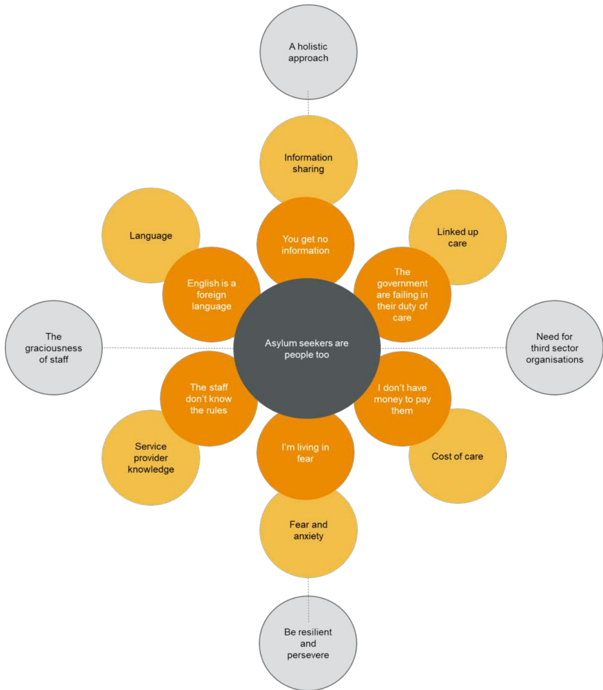
Figure 2 Main themes